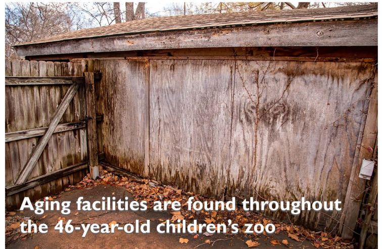
Aging facilities are found throughout the 46-year-old children's zoo