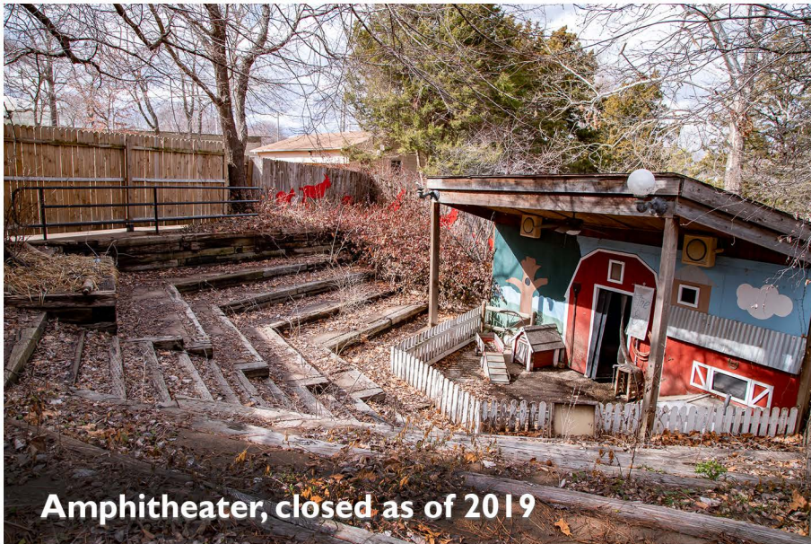
Amphitheater, closed as of 2019

The bones of the current Children's Zoo were constructed in 1977.