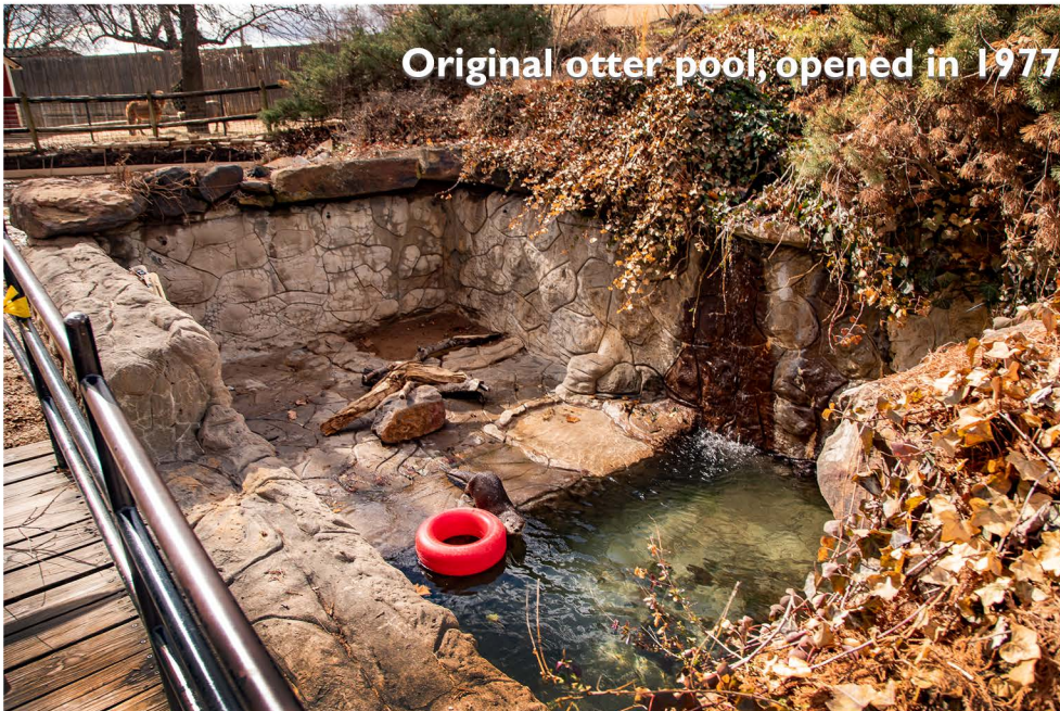
Original otter pool, opened in 1977

A full rebuild is needed to create an ADA-compliant space for children.